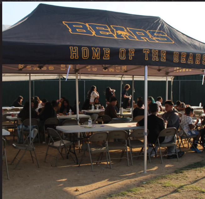
Fall 2025 AVID Tailgate