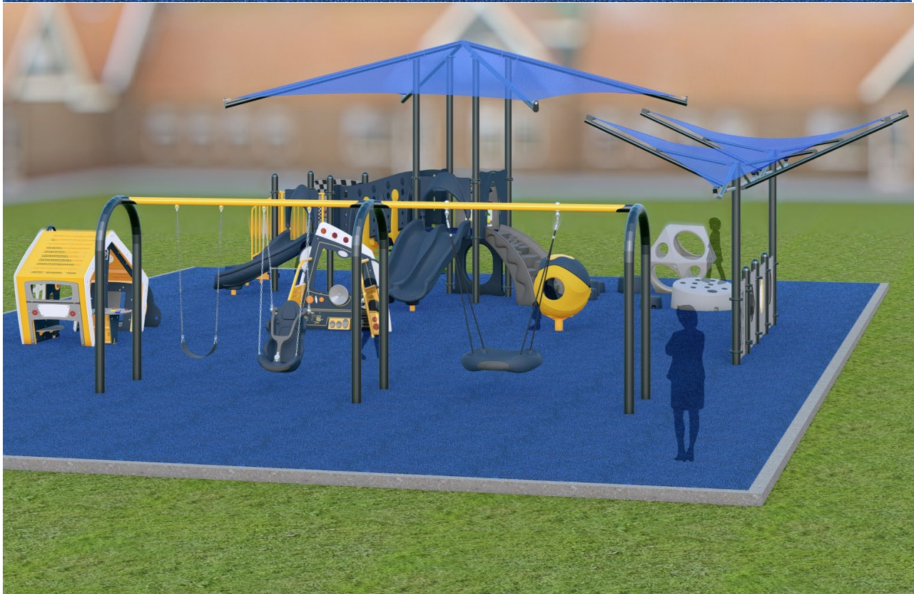
Downey USD Pace Education Center Playground Equipment