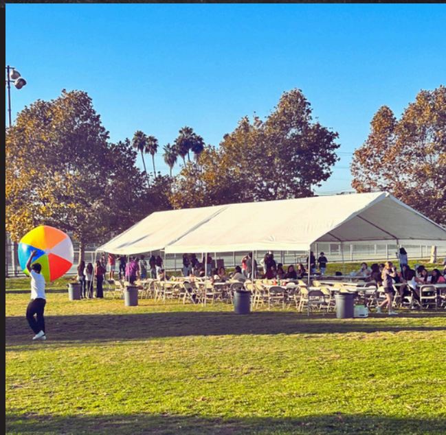
Fall 2024 AVID Tailgate