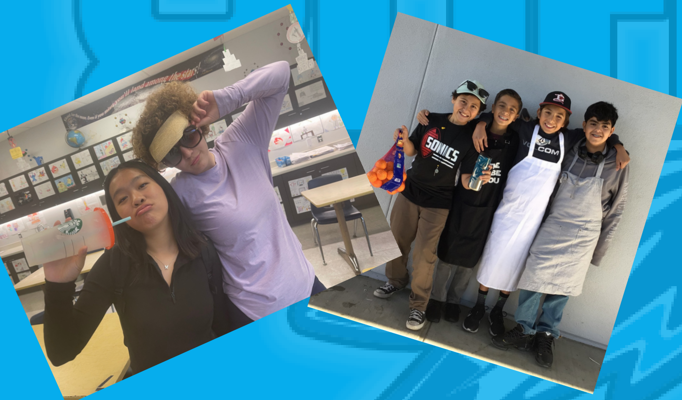
Soccer Mom vs BBQ Dads

ASB provides opportunities for students to show their school spirit and have fun at school by creating themed spirit weeks. During spirit weeks ASB hosts a 2nd period Spirit Competitions where the 2nd period class that has the most participation throughout the week wins Krispy Kreme Doughnuts. ASB also hosts Lawn Parties during Spirit Weeks at lunch with music, games and prizes.