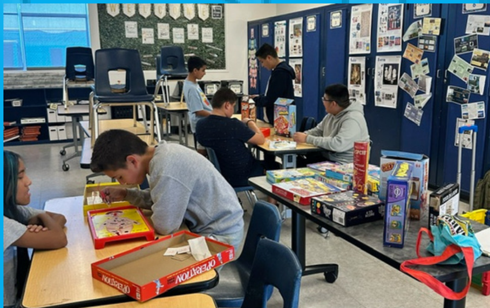
Board Game Club

Griffith's Campus boasts a total of 17 clubs, each with a unique focus. Clubs such as Robotics and Chess Club concentrate on developing specific skills, while others like Dungeon and Dragons, Pokemon, and Dance Club cater to specific interests and hobbies. Additionally, some clubs like Red Cross and Builders Club engage in community service activities. Finally, we have clubs such as 6th, 7th, and 8th-grade CJSF and Femineers, which center on academic pursuits.