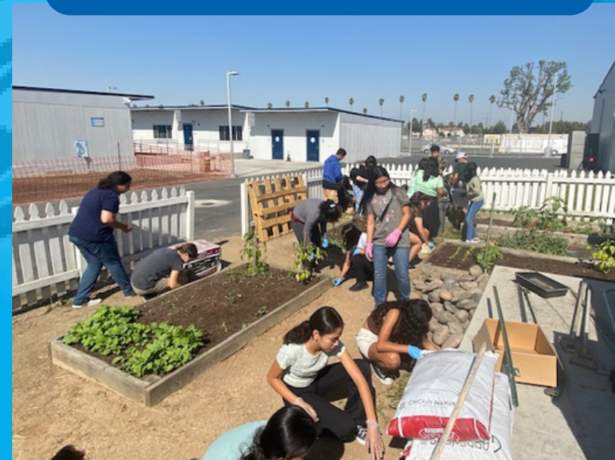
Red Cross Club