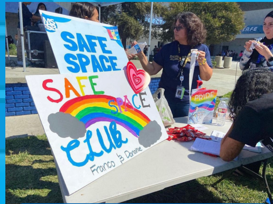
Safe Space Club