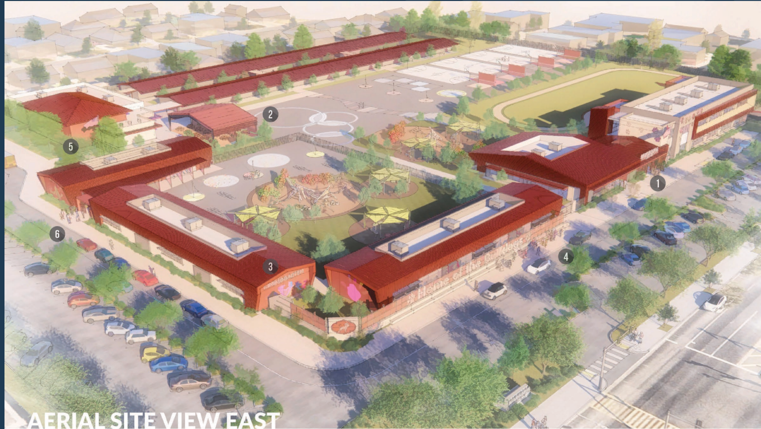
AERIAL SITE VIEW EAST

Fully utilizing the property areas parallel and perpendicular to Imperial Highway, the vehicle capacity for pickup and drop-off has been significantly increased, with available parking accessible to the Administration Office, TK/Kindergarten, and after school activities. Both existing buildings and new additions are woven together to create a secure barrier that surrounds the campus, insulating a sense of safety for parents, staff, and students alike. With dedicated, secure access points established for various grade levels, wait times and congestion in these areas are greatly reduced.