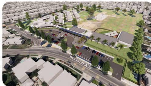
2 SOUTHWEST AERIAL VIEW