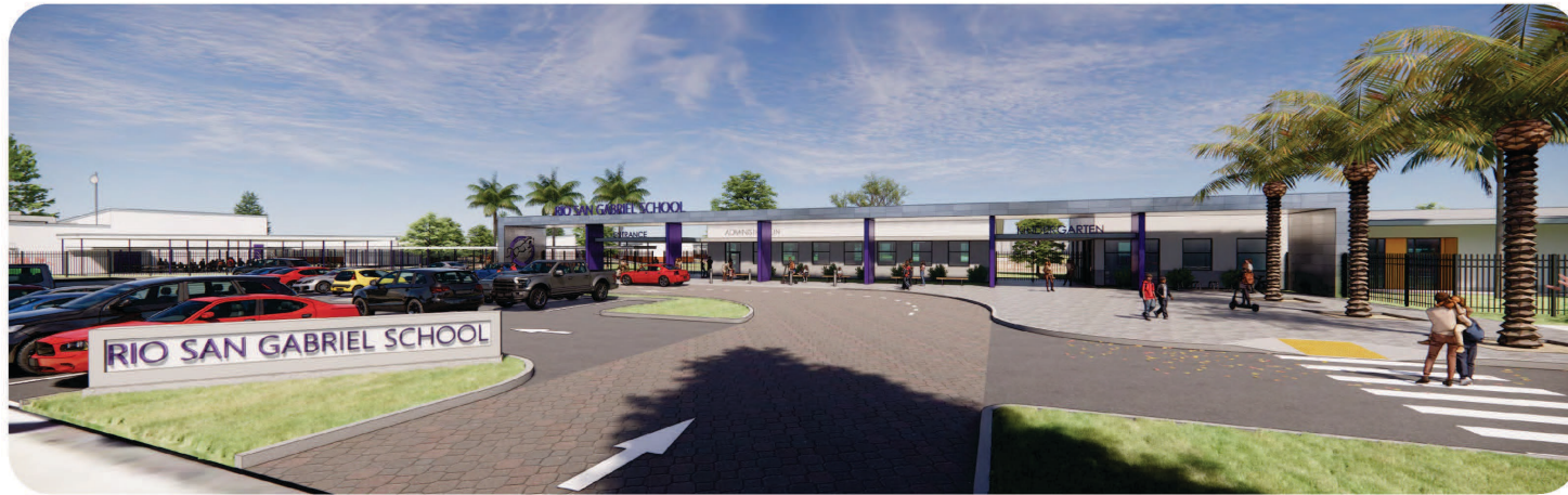
1 SOUTHWEST MAIN CAMPUS "FRONT DOOR" VIEW