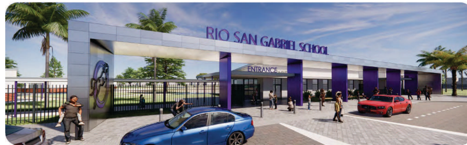
3 NORTHWEST MAIN ENTRY VIEW