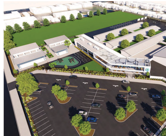
AERIAL VIEW OF NEW CLASSROOM BUILDINGS, TK-K PLAY YARD, AND PARKING / DROP-OFF