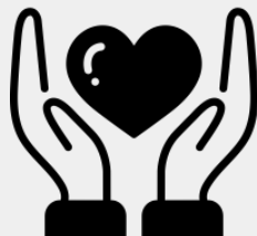
Social Emotional Learning