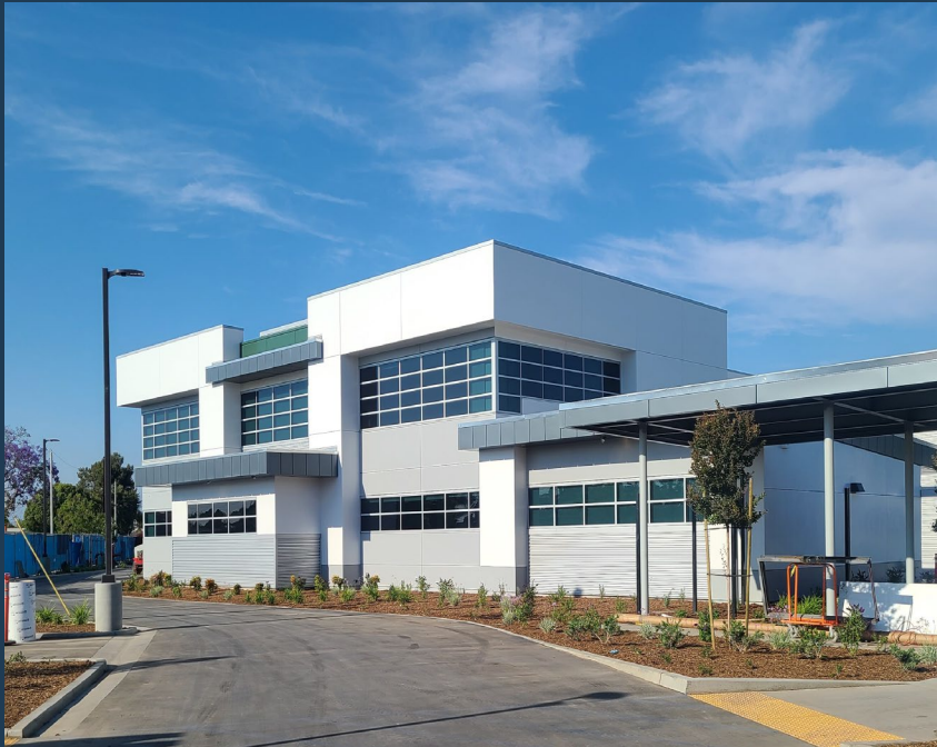
Two-Story Science Substantially Complete