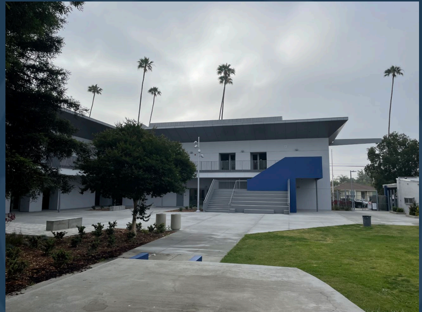
New Two-Story Classroom Building Currently In Use