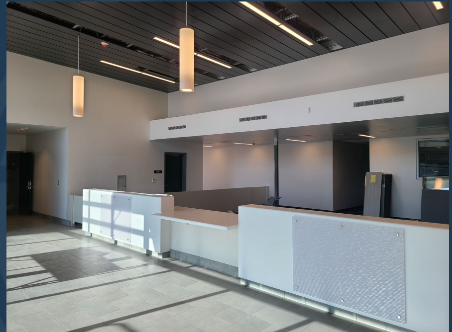
Administration Building - Exterior and Interior - Substantially Complete