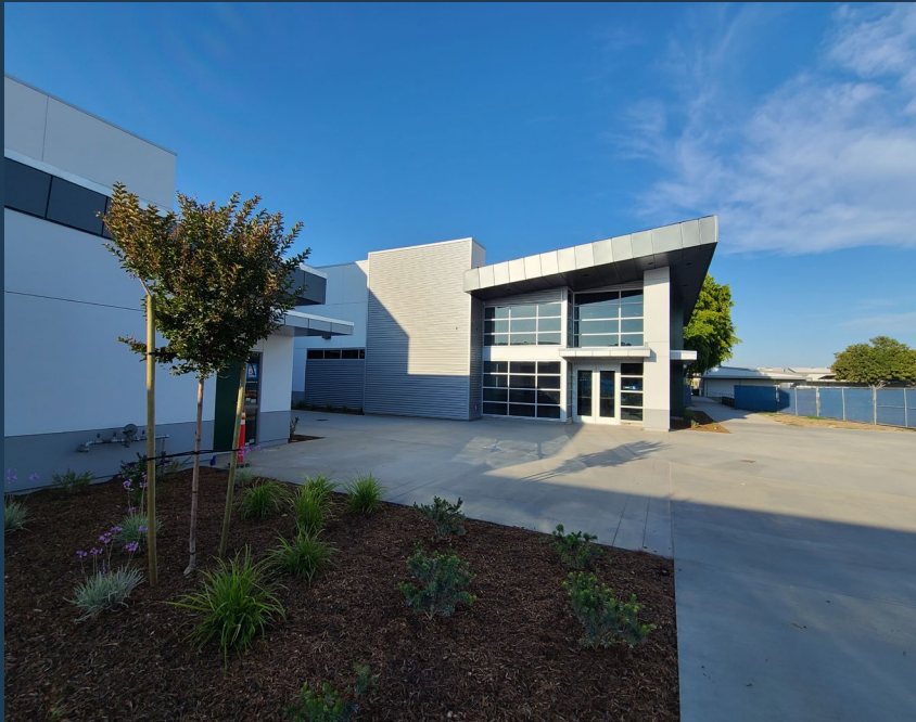
Library Substantially Complete