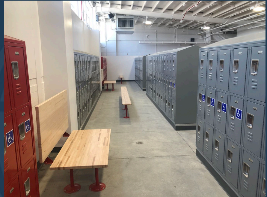
Modernization of Locker Room and Restroom – Currently In Use