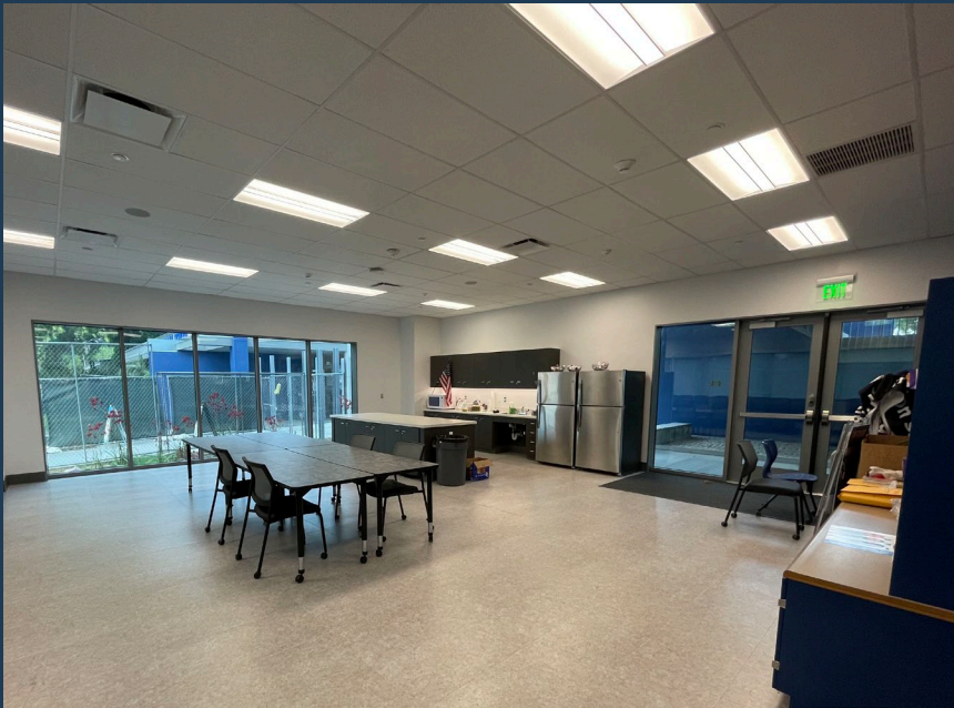
Teachers Work Room and Lounge