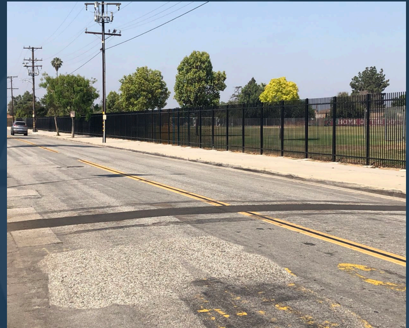
Exterior Painting and New Rod Iron Fencing