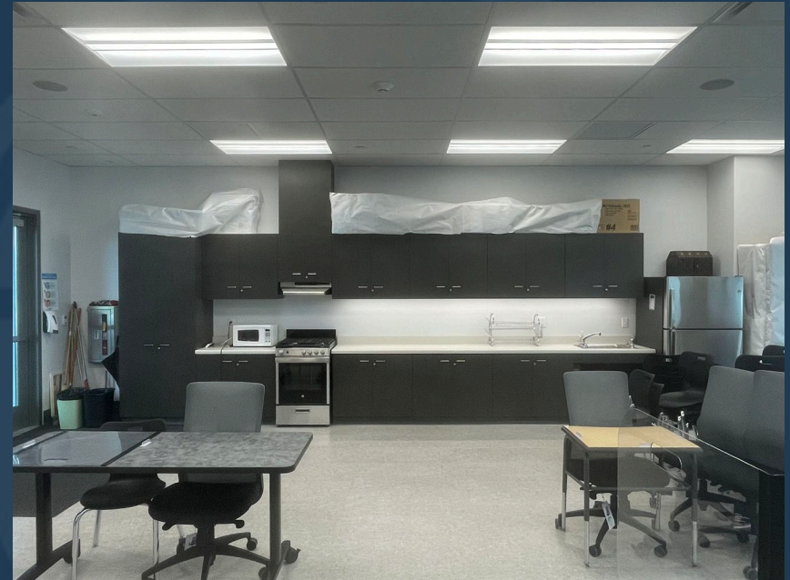
Special Education Classroom